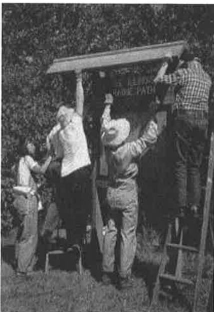
Prairie Path volunteers installed a display case stand at Main Street in Lombard.

In 1963 a small group of trail enthusiasts, led by noted naturalist May Theilgaard Watts, determined to develop a nature path through the western suburbs of Chicago. In 1965 they formed The Illinois Prairie Path, a not-for-profit corporation made up of volunteers; and in 1966 after much work, they leased the old Chicago, Aurora and Elgin (CA&E) Railroad right-of-way from the new owner, DuPage County, and began building the trail. The first green-and-white logo signs went up in 1967, and the Path was officially on the map. In 1971 most of the Illinois Prairie Path was designated a National Recreation Trail, part of the National Trails System. In